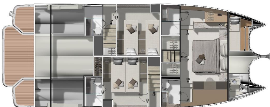
3 cabines / 3 salles d'eau